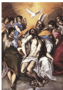
The Most Holy Trinity

Jesus said, "Everything that the Father has is mine; for this reason I told you that he will take from what is mine and declare it to you"